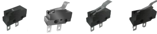
(size : 14.0×6.8×7.0) Snap Action Type (Spring Plate Type)